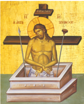
Icon of Christ's Extreme Humility