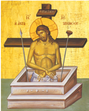
Icon of Christ’s Extreme Humility

Our Parish Prayer List for Special Intentions and Other Needs* A Prayer For The Sick: O Christ, You alone are prompt to defend us; quickly visit Your suffering servant name(s) . Through the prayers of the Theotokos, deliver him/her/them from sickness and bitter pain. Heal him/her/them so that he/she/they may sing to You and always praise You for You alone love us. Amen.