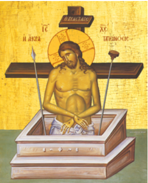
Icon of Christ's Extreme Humility