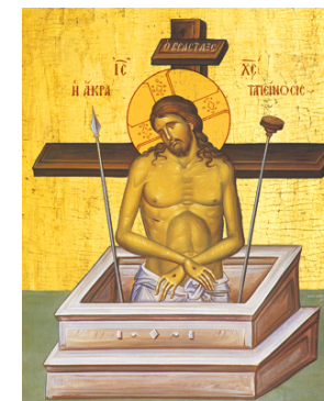
Icon of Christ's Extreme Humility

This is the Faith of the Apostles! This is the Faith of the Fathers! This is the Faith of the Orthodox! This is the Faith which has established the Universe!